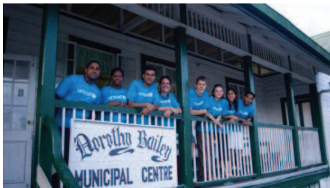
The Canadian trip participants at the Dorothy Bailey Health Centre.