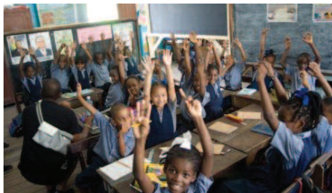
Eager students at an elementary school in Georgetown, Guyana.

“We went to a Guyana school where the program was occurring and we saw the coach actually get through to the kids.”